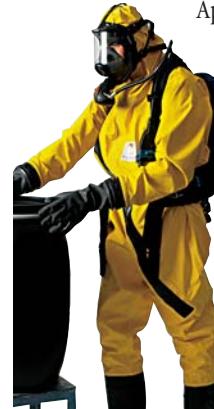
art. no. A140340 L / XL

Neoprene chemical protective gas-tight suit with a neoprene rubber, elastic face seal over which a full-face mask can be placed. Approved to prEN 943-1 class 1B. The seams of the gas-tight suit are stitched, taped and sealed and therefore gas proof. The breathing apparatus is worn on the outside of the suit.