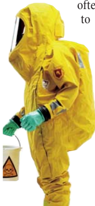
art. no. A164504/A164505 L / XL

Neoprene chemical protective suit that can be used very quickly in the event of accidents. Fire brigades and disaster controllers are often unexpectedly exposed to dangerous chemical substances. Available as an overall as well as a poncho and trousers. Approved to EN 466.