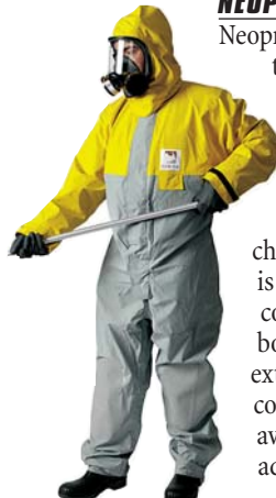
art. no. A164221, A164223 sizes M / L / XL / XXL

Neoprene overall approved to EN 465 Class 4. Specially developed for situations where wearers are exposed to high concentrations of chemicals. Neoprene is known for it's comfortable wear in both cold and extremely hot conditions. Also available with glove adaptor and hood.