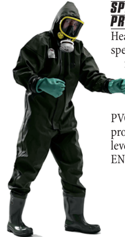
art. no. A164380 sizes M / L / XL / XXL

Heavy duty overall specially developed for work in sewers and liquid tanks. Made of thick, elastic PVC and is liquid proof up to chest level. Approved to EN 343.