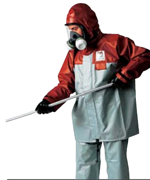
art. no. A163731 sizes M / L / XL / XXL

Approved to EN 467 fitted with a double upright collar with zip fastener for hood attachment. The zipper is covered with a Velcro flap. The sleeves are finished with Velcro fasteners.