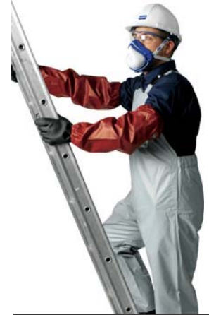
art. no. A163332 sizes M / L / XL / XXL

Approved to EN 467 fitted with adjustable shoulder straps.