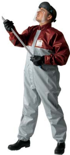
art. no. A164242 sizes M / L / XL / XXL

Approved to EN 465 class 4 fitted with collar with zip fastener for hood attachment.